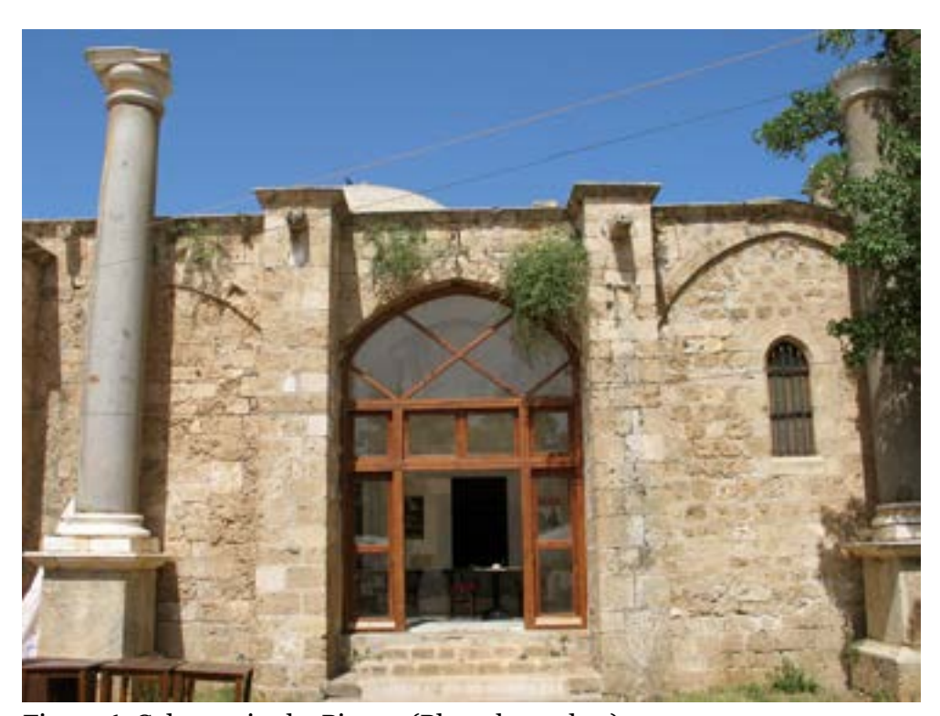
Figure 6. Columns in the Piazza.