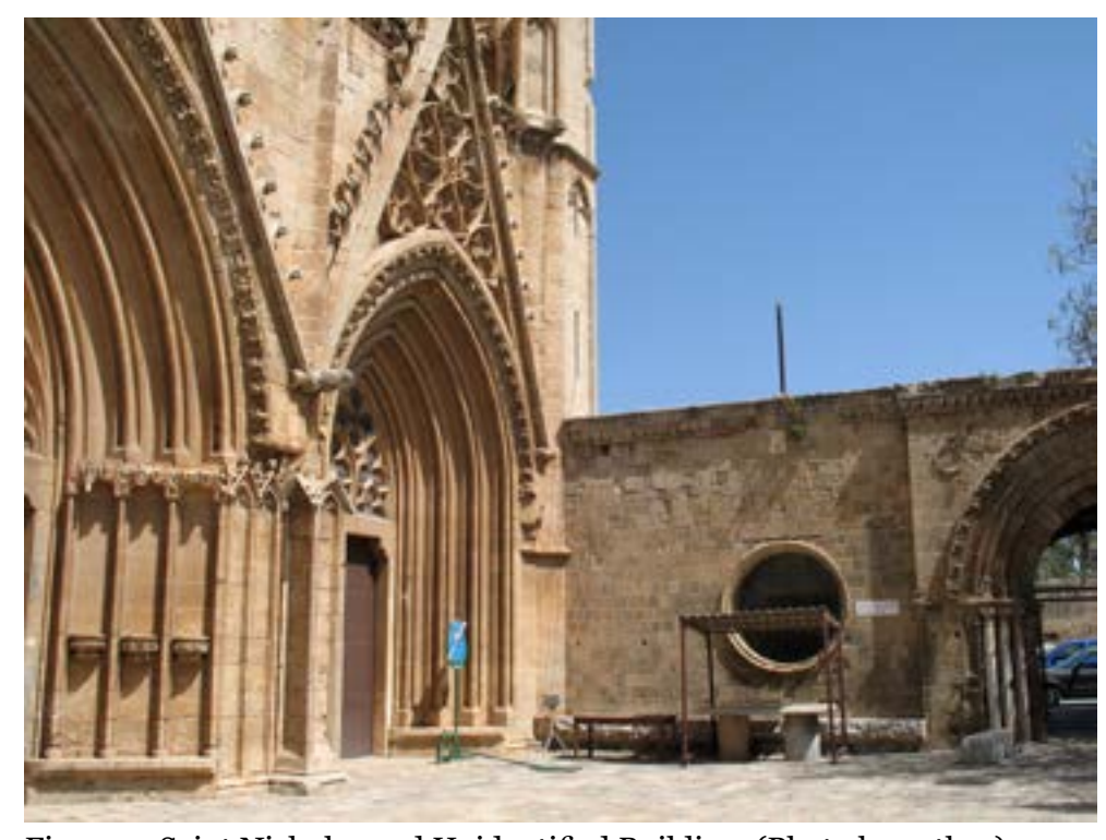
Figure 4. Saint Nicholas and Unidentified Building.