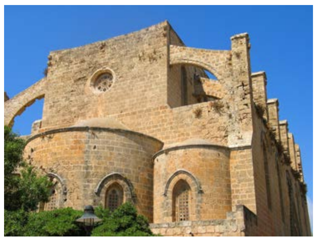
Figure 3. Saints Peter and Paul.