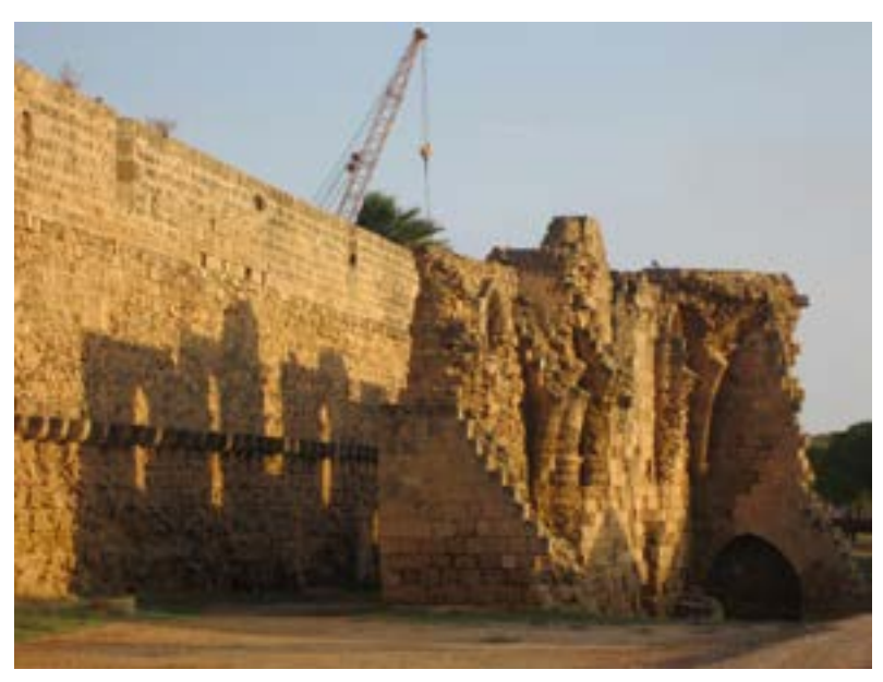
Figure 1. Saint Anthony.