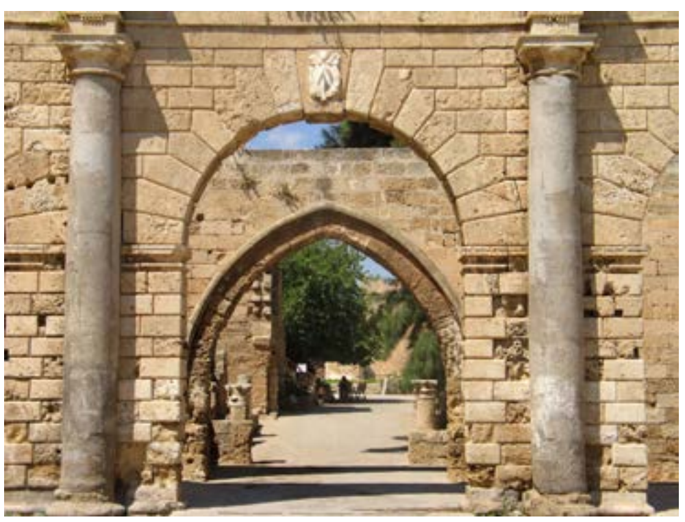
Figure 5. Palazzo.