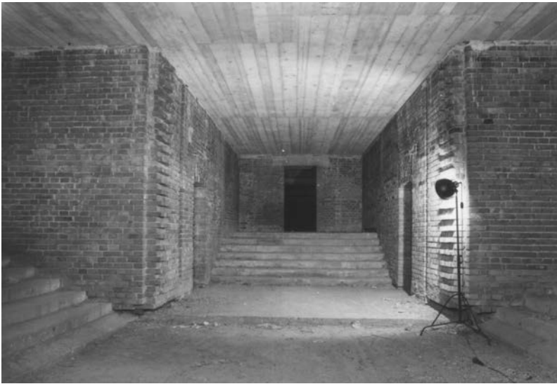
Figure 5. The former Congress Hall, Nuremberg, interior. Photograph provided by the Nuremberg City Museums at the time of the competition, 1998, taken in 1997. (Dokumentationszentrum Reichsparteitagsgelände, no. 0275-02)