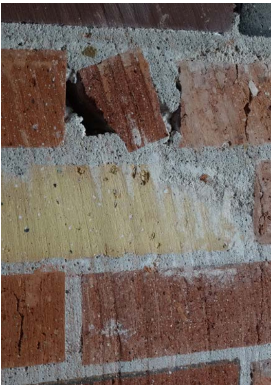
Figure 4. The trace of the circular saw visible in the gallery, Documentation Center Nazi Party Rally Grounds, 2017.