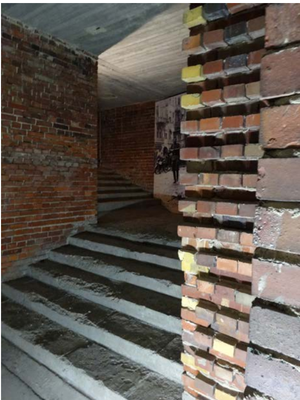
Figure 6. The Documentation Center Nazi Party Rally Grounds, interior. Space between Galleries 17 and 18, 2017.