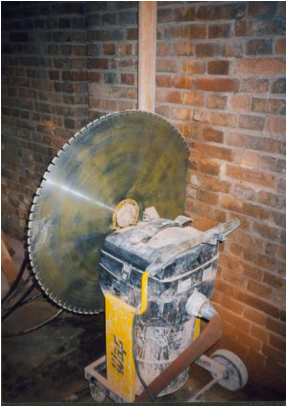
Figure 3. The circular saw used to cut the pre-existing brick and stone walls.