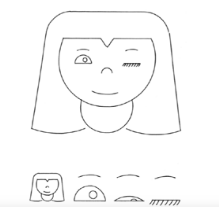
Figure 6. Winking Girl (Nefertiti), Sutherland, Sketchpad Dissertation, 1963.