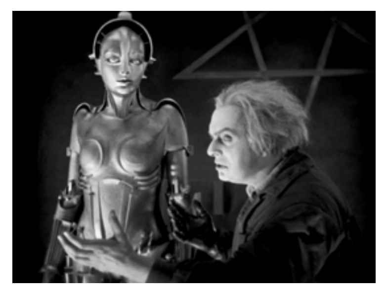
Figure 4. Robot Maria, Metropolis, 1927.