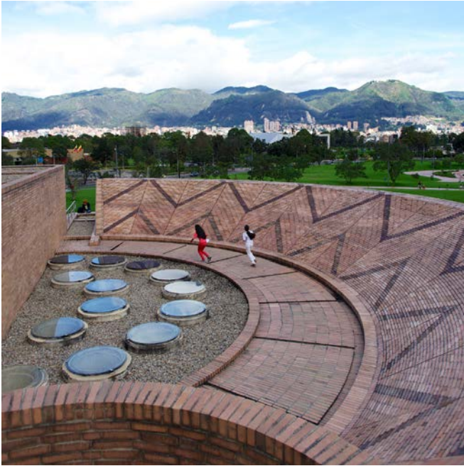
Figure 13. Rogelio Salmona, Virgilio Barco Library, roof and view of the Andes.