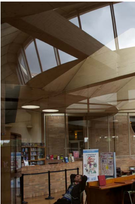
Figure 14. Rogelio Salmona, Virgilio Barco Library, reflections: the reading room.