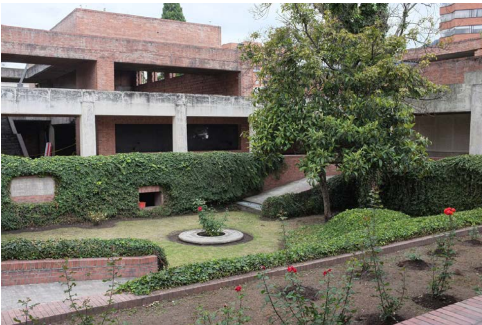
Figure 6. Centro Gaitán, the well-maintained courtyard with the grave of Gaitán.