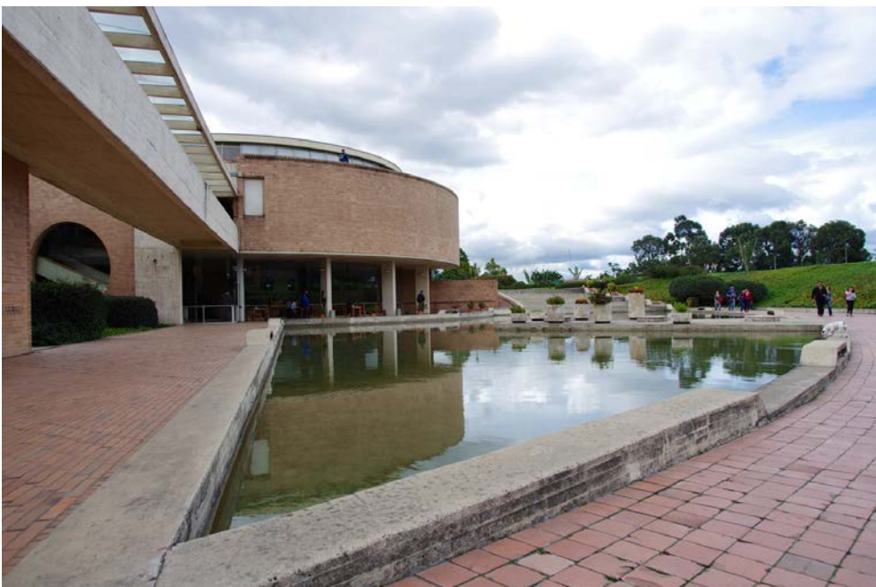
Figure 12. Rogelio Salmona, Virgilio Barco Library, side of the library.