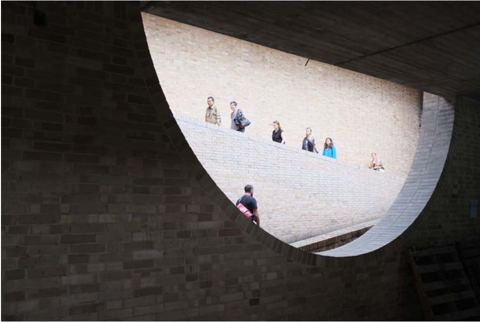
Figure 7. Rogelio Salmons, Centro Gaitán, Detail.