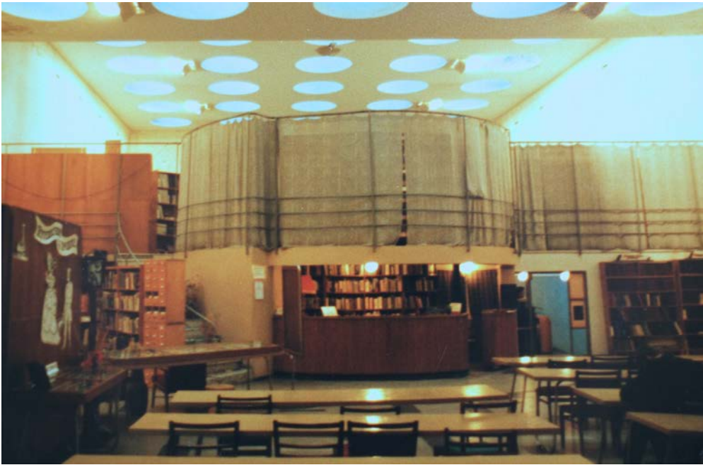
Figure 3. Alvar Aalto, Viipuri City Library, Reading room.