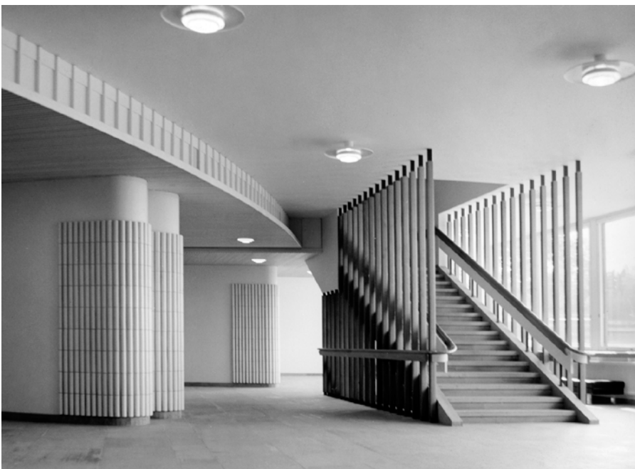
Figure 10. Alvar Aalto, University main building, interior hall. (Courtesy of the Alvar Aalto Foundation)