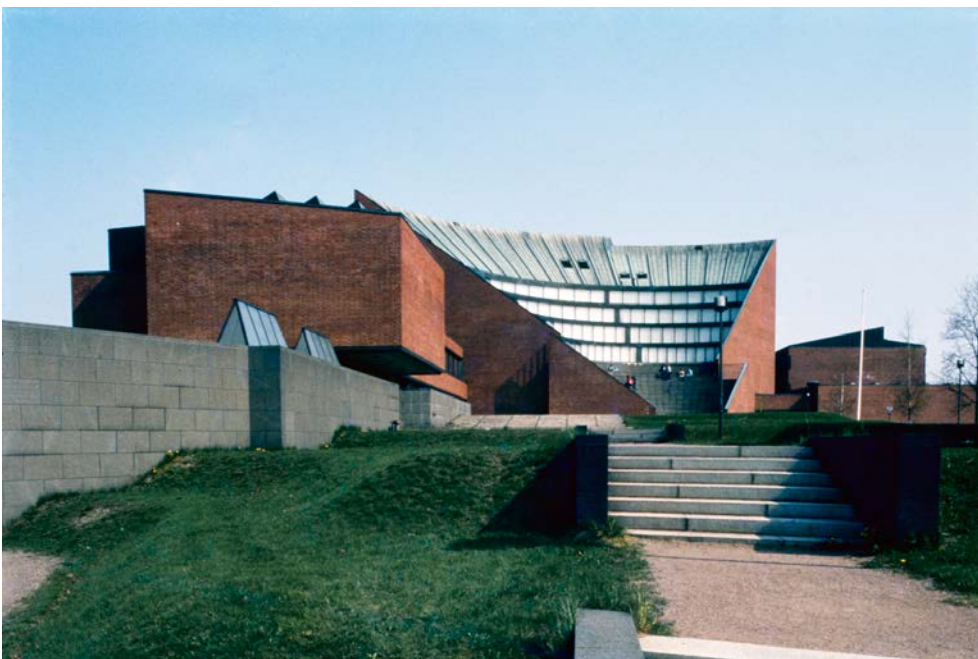
Figure 8. Alvar Aalto, University Campus Otaniemi, Helsinki. Landscape, stepping up to the main auditorium.