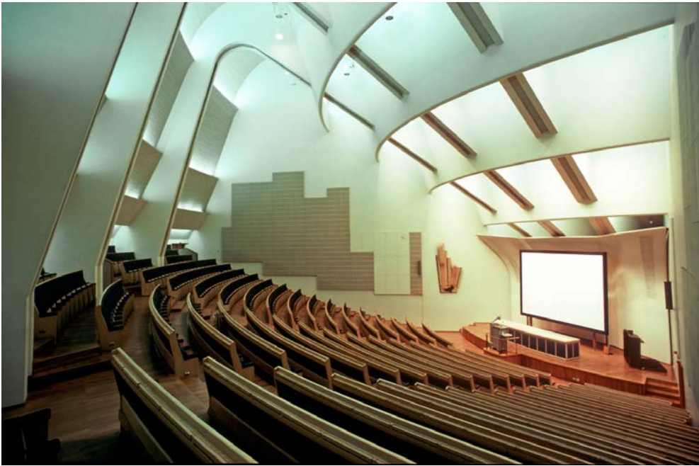
Figure 9. Alvar Aalto, University Campus, Main auditorium, interior.