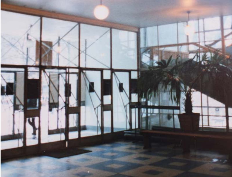
Figure 1. Alvar Aalto, Viipuri City Library, Entrance hall.