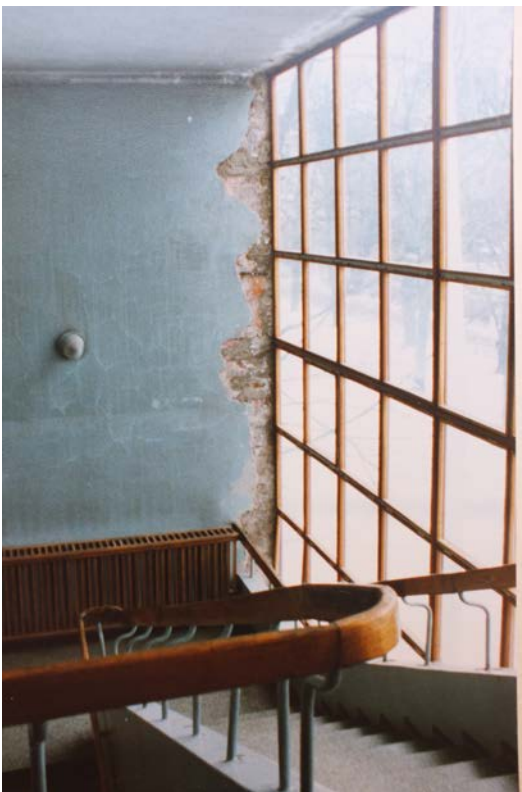
Figure 2. Alvar Aalto, Viipuri City Library, Staircase.