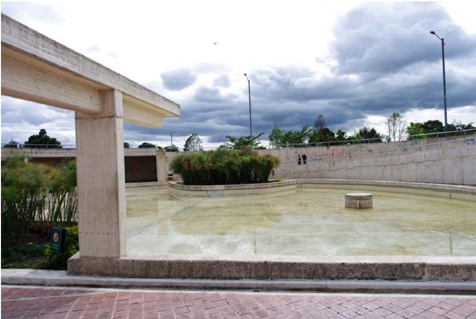
Figure 11. Rogelio Salmona, Virgilio Barco Park, Bogotá, the circular pond.