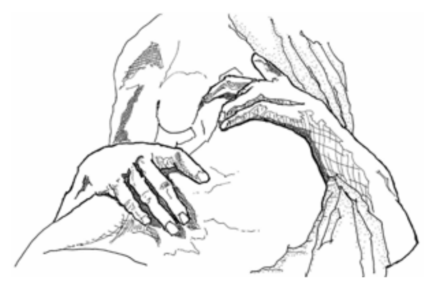
Figure 1. Drawing after Gian Lorenzo Bernini's Pluto and Proserpina , 1621-22. (Drawing by D. Kassem)