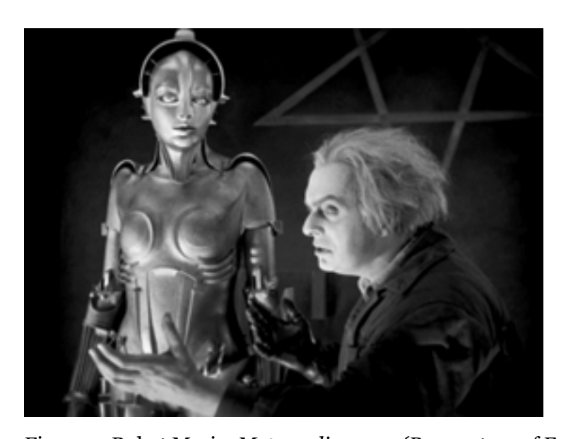
Figure 4. Robot Maria, Metropolis , 1927.