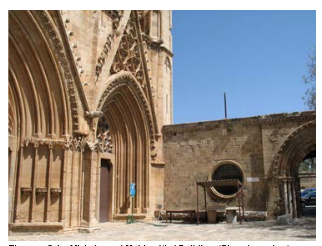
Figure 4. Saint Nicholas and Unidentified Building.