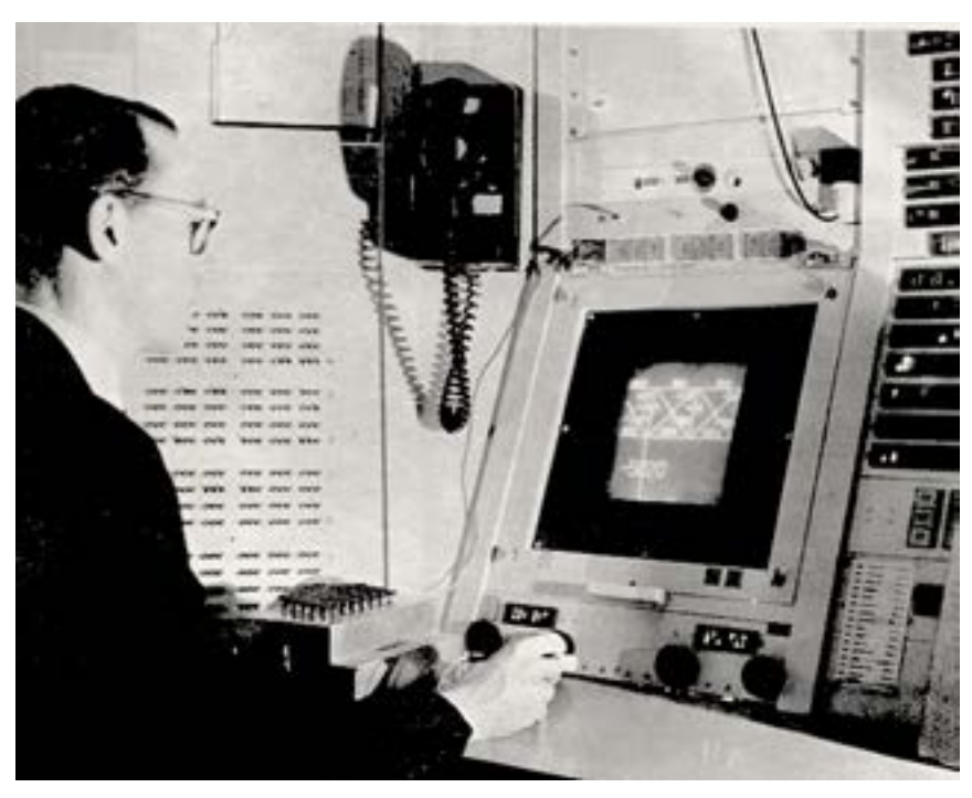
Figure 5. Sutherland operating Sketchpad on the TX-2 computer at MIT, 1963.