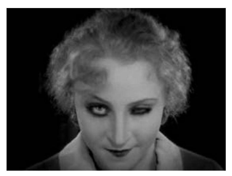
Figure 3. Robot Maria, Metropolis , 1927.