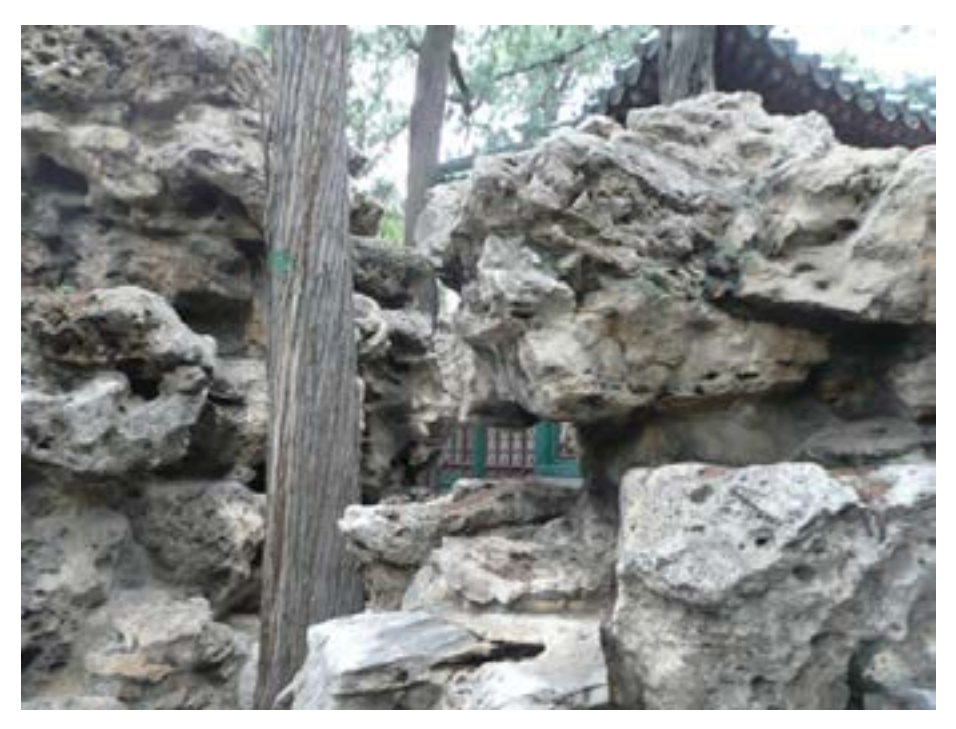
Figure 3. Rocks in the Qianlong Garden of the Forbidden City.