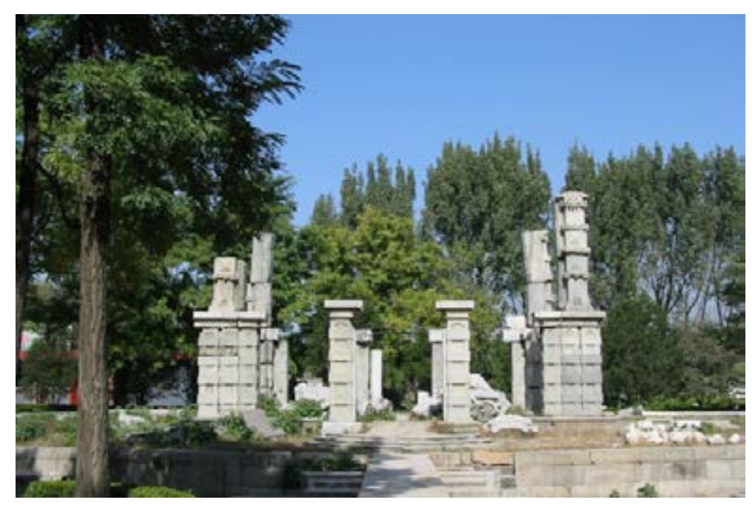
Figure 1. The rustic order of the "View beyond the World" house in the Western garden of the Yuanmingyuan.