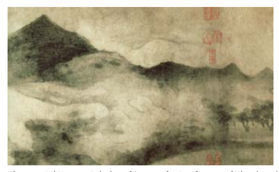
Figure 2. Mi Youren, Painting of Spectacular Landscapes of Xiaoxiang (partial view) (12th century), collected by the Palace Museum of Beijing.